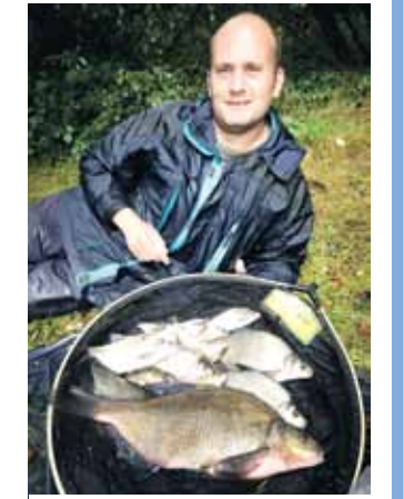
Skimmers and a 'proper' bream.

LAKE FOUR - The club gained the lease to this water at the beginning of the year and its stocks are a bit of a mystery. Members that have ventured on to it have taken double-figure nets of rudd and perch on waggler and maggot tactics.