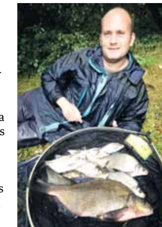
Skimmers and a 'proper' bream.

LAKE FOUR - The club gained the lease to this water at the beginning of the year and its stocks are a bit of a mystery. Members that have ventured on to it have taken double-figure nets of rudd and perch on waggler and maggot tactics.