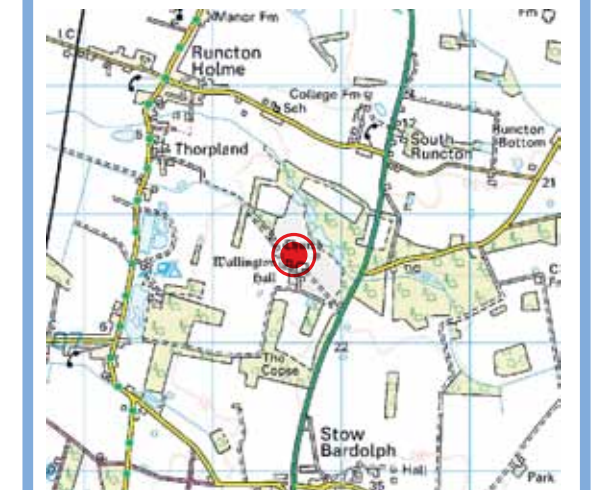
Ordnance Survey mapping © Crown copyright Media 031/13